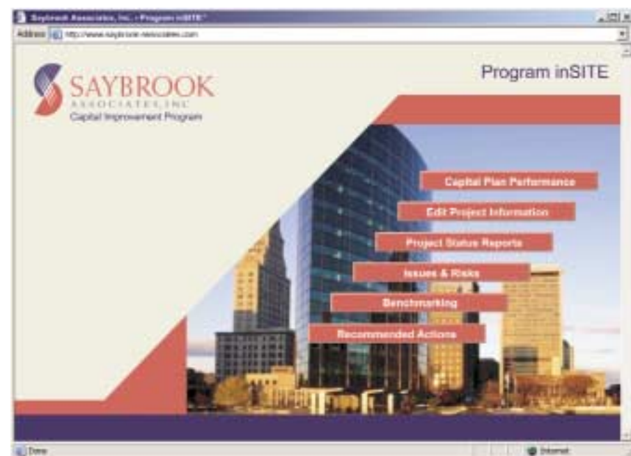
Saybrook Program inSITE™ - a web based application